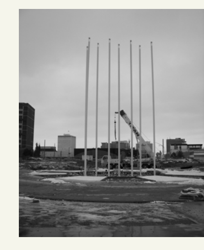
Construction and Installation began in October, 2006